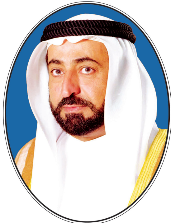
His Highness Sheikh Dr. Sultan Bin Mohammed Al Qassimi, Member of the Supreme Council UAE & Ruler of Sharjah