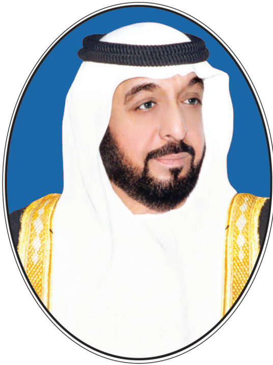
His Highness Sheikh Khalifa bin Zayed Al Nahyan, President of UAE